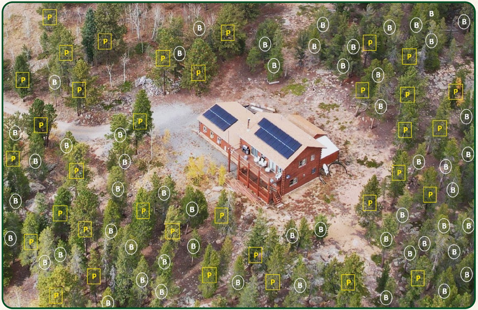
Verbenone treatment plan that uses a combination of Pouches and Bubbles.

The diagram below provides an overhead view of how to apply Verbenone to maximize the efficacy of the product. Pouches were placed first, prioritizing the largest trees around the house. Bubbles were dispersed in areas that fall between the effective radius of the pouches, on smaller trees and in denser stands around the property boundary. This Verbenone treatment plan uses 32 pouches and 47 bubbles.