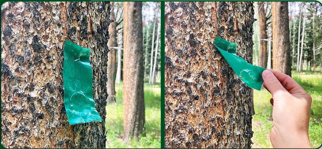
Verbenone bubble stapled to the north-facing side of the tree, bubble side down.