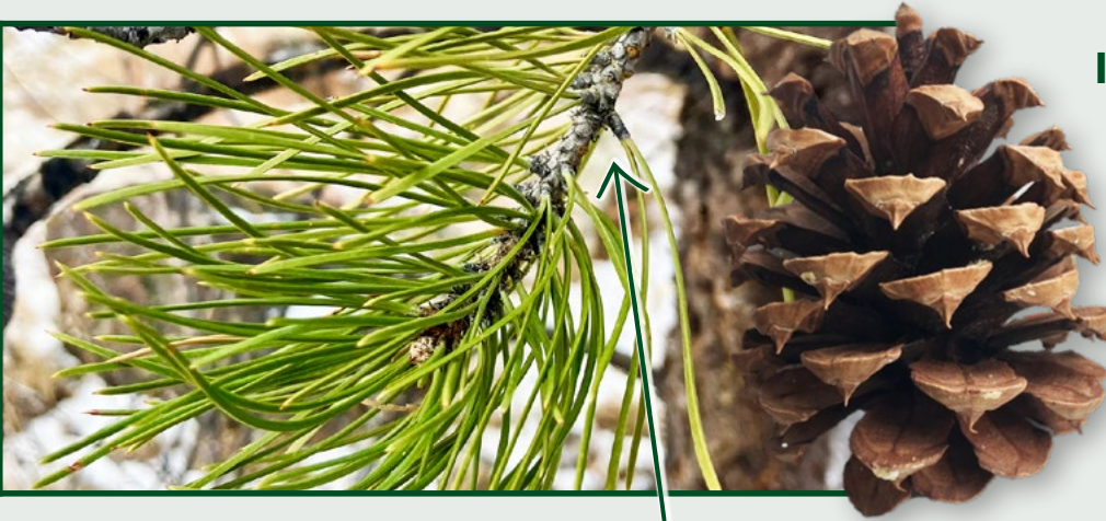
Fascicle with needles growing in clusters of two or three