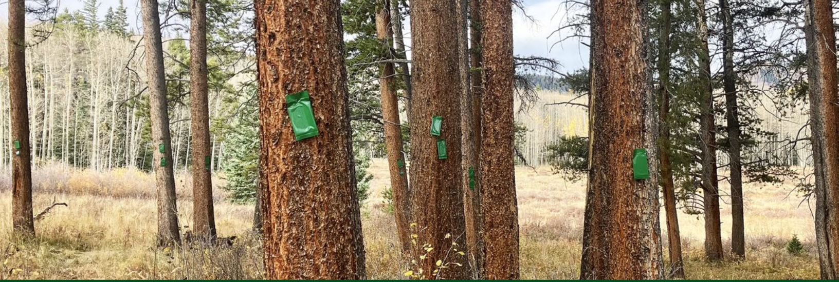
Verbenone packets in a residential community near Gunnison.