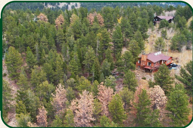
Group of pine trees fading following successful mountain pine beetle attack. ▶ Photo: Dan West, CSFS

Following a successful attack, pine needles will turn yellowish to reddish in color. The needles will begin to fall from the branches the second summer after attack.