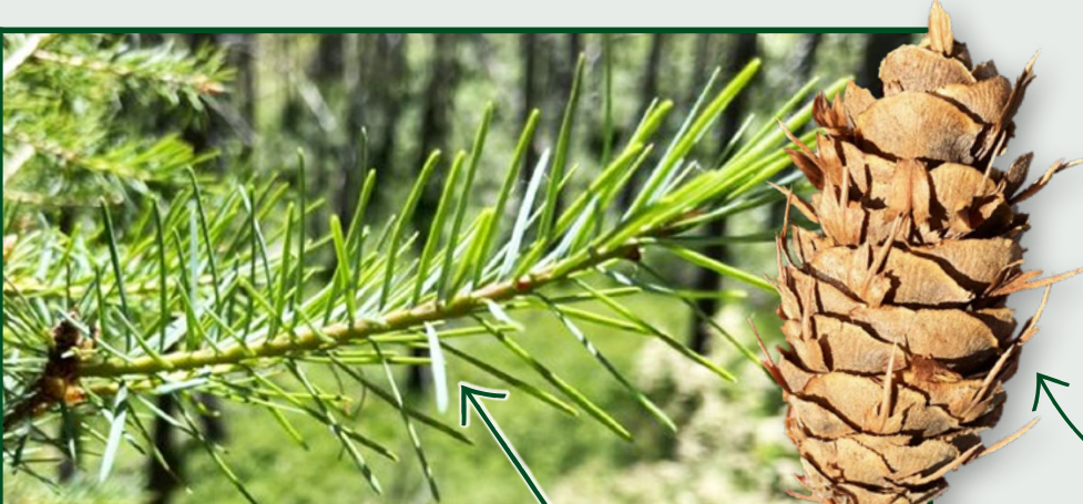
Needles growing individually