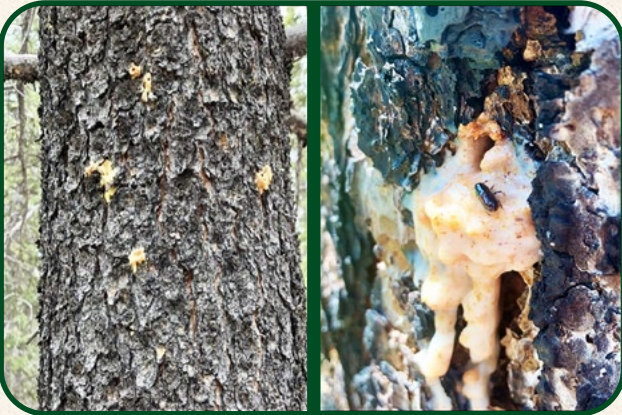
Pitch tubes on a lodgepole pine (left). Beetle being pitched out of a ponderosa (right). ▶

Infested trees usually have several popcorn-shaped masses of resin around the trunk where beetles have tunneled into the bark. However, pitch tubes may not be present in years with below average precipitation.