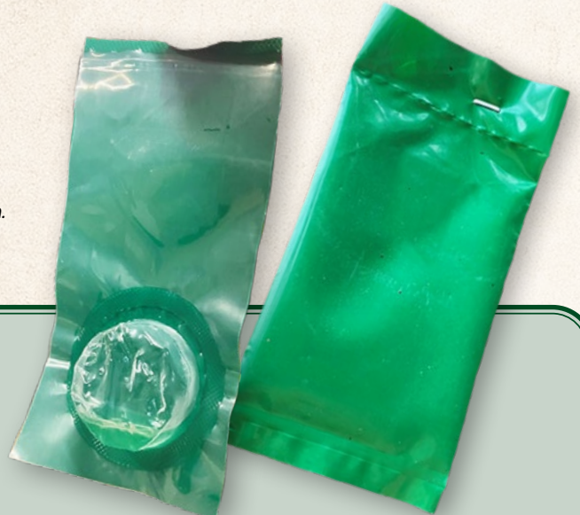
Verbenone pheromone packets: Bubble (left) & Pouch (right).

In nature, bark beetles communicate with pheromone scents called semiochemicals. Verbenone is an anti-aggregation pheromone produced by mountain pine beetle ( Dendroctonus ponderosae ) to indicate a tree has reached maximum capacity and there are no resources available for other beetles. Verbenone has been synthesized into small packets that can be attached to all varieties of pine trees as a sort of “No Vacancy” sign to prevent new infestations. Verbenone works by affecting beetle behavior, making it an environmentally safe alternative for tree protection.